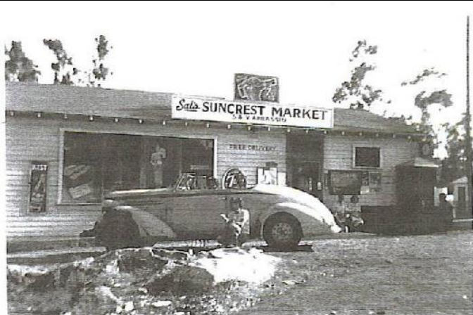
Sal's Suncrest Market 1948 (Remodeled in 1944)