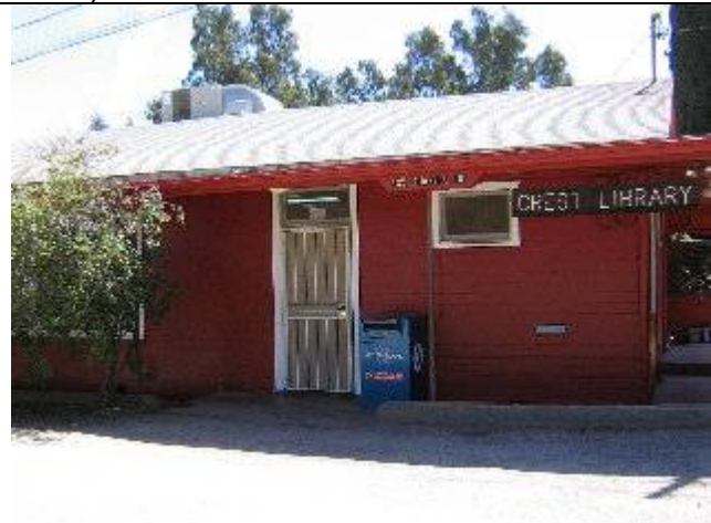
Now the Crest Library – 2007 (converted 1976)