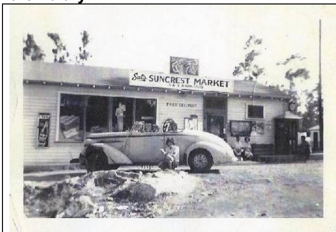
(Do you have old photos or stories to share?)

The Crest Historical Society meets the first Tuesday of each month at 1 pm at the library. Are you interested in helping to put a publication together regarding Crest History? This project, a joint venture between the Crest Sun and the Historical Society is in the works. If you are interested in this project or if you have Crest history to share, join us May 3 at 1 pm at the library.