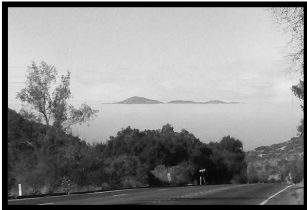
"Island's in the sky" – A drive down the grade into foggy El Cajon"